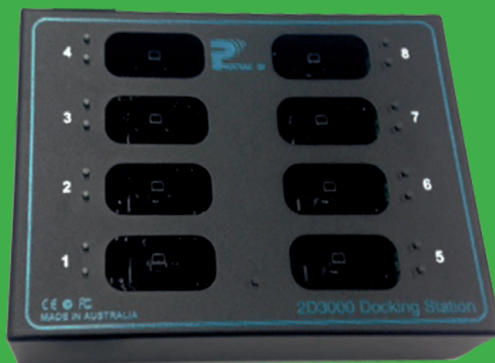
2D3000 Docking Station